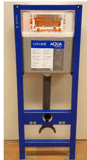
Fig. 1 Aqua 22MECH NORDIC Figure: Cersanit S.A.

It is documented that the installation frame, including WC pan, withstand a load of 400 kg.