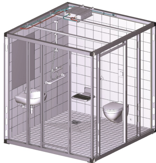
Internal view; Bathsystem Superlight Bathroom Pod

The floor has a slope of min. 1:100. The shower area has a slope of min. 1:50. The height difference from the gully grate and the floor waterproofing membrane at the door opening is min. 25 mm.