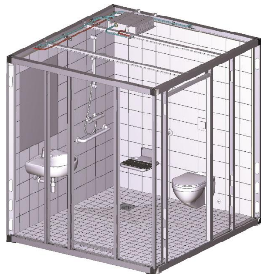
Fig. 1 Internal view; Bathsystem Superlight Bathroom Pod

The floor has a slope of min. 1:100. The shower area has a slope of min. 1:50. The height difference from the gully grate and the floor waterproofing membrane at the door opening is min. 25 mm.